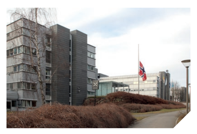
Flag at half-mast at Kvaerner's HQ at Vækerø after the fatal accident at the yard at Stord 9 March 2015.

The main energy consumption, carbon emissions and waste disposal vary according to activities at the yards. Total energy consumption by the business in 2015, based on recorded use of oil, gas and electricity, amounted to 59 300 megawatt-hours compared to 70 500 megawatt-hours in 2014. Carbon emissions relating to this use are estimated at 4 700 tonnes in 2015 compared to 4 500 tonnes in 2014.